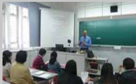
English: School-based Support Services for Primary Schools: Writing workshop