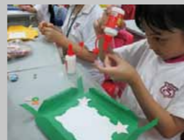
Students in Drawing Enhancement Group preparing crafts for Fathers' Day.