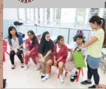
CYC Groups did the activities with the instructor.