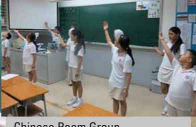
Chinese Poem Group