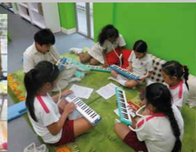
Students in Melodica Group practised seriously for the ECA performance.