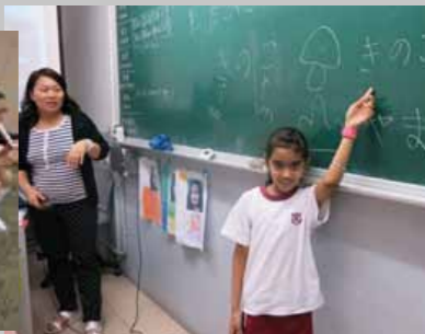
Japanese Learning Group