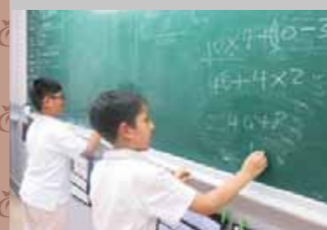
Mathematics Enrichment Course