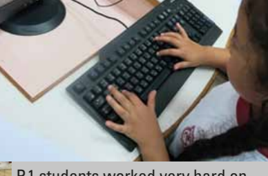
P.1 students worked very hard on typing the words in P.1 Typing Class.