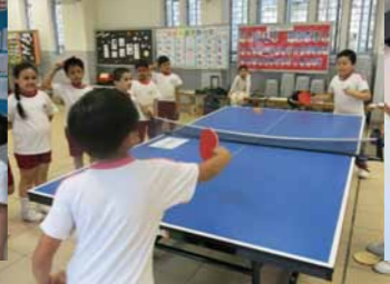
Table Tennis Group