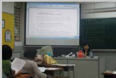
Chinese: School-based Support Services for Non-Chinese Speaking Primary Schools