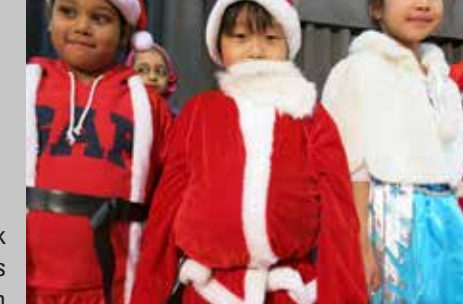
P.1 – P.3 students took part in the Christmas Costume Competition.