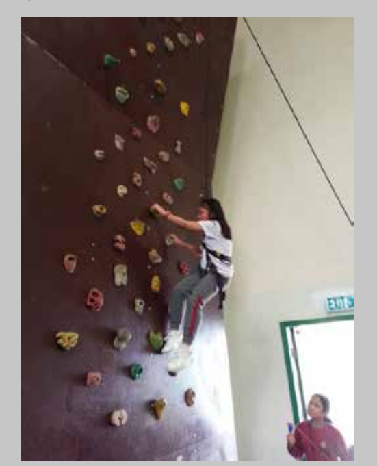
Students climbing the sports wall in Po Leung Kuk Tai Tong Holiday Camp.