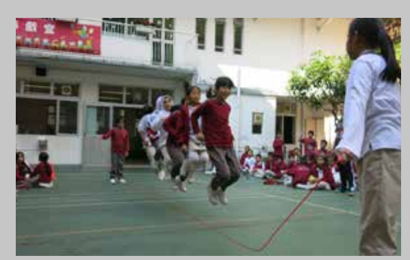
P.3-P.4 Group Skipping Competition