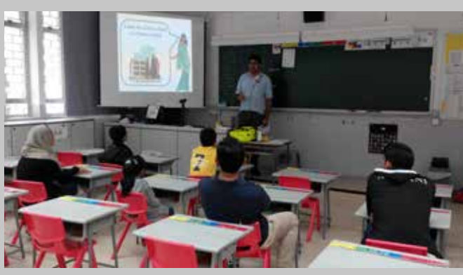
There was a special workshop for Hindi and Urdu speaking parents.