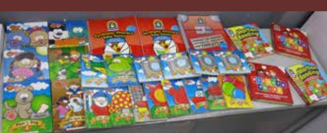
English Phonics learning materials

In the future, Li Sing Tai Hang School will continue collaborating on support programmes with KSMT and SIS. We sincerely appreciate the support from KSMT and SIS.