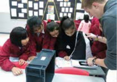
Student and teacher volunteers from SIS assisted us on the Maths Activity Day.