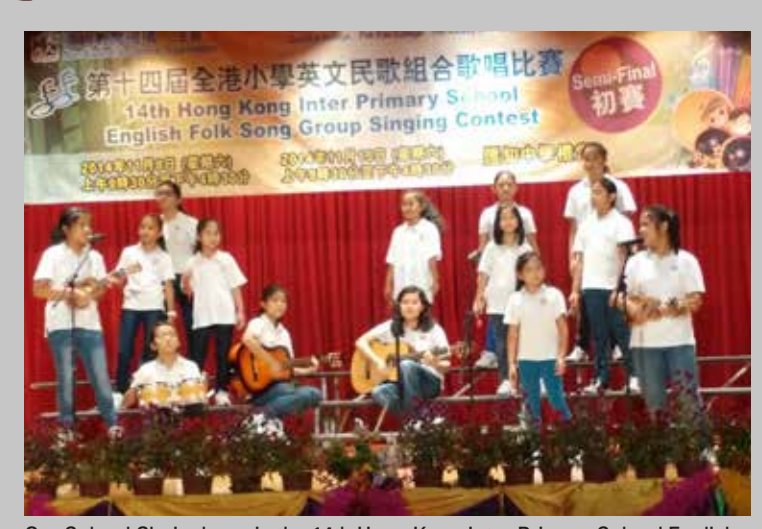
Our School Choir shone in the 14th Hong Kong Inter Primary School English Folk Song Group Singing Contest. They received the Group Champion award in the preliminary round.