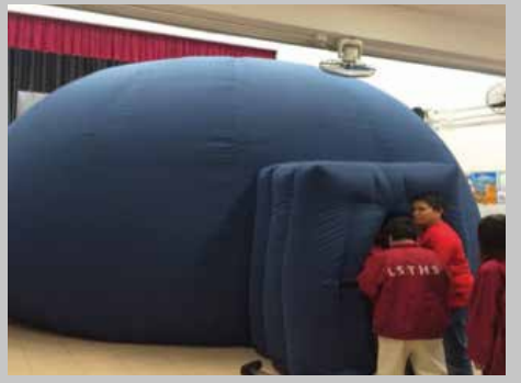
Students entered the Discovery Dome sponsored by the KSMT.