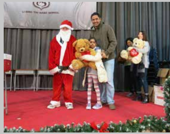
Santa Claus presented gifts to parents and students.