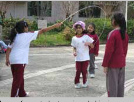
Lower form students enjoyed skippin