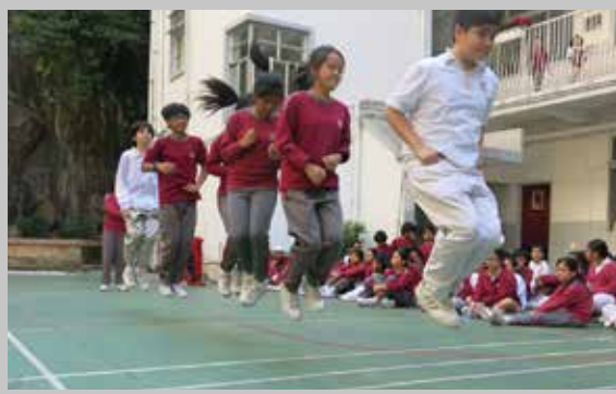
P.5-P.6 Group Skipping Competition