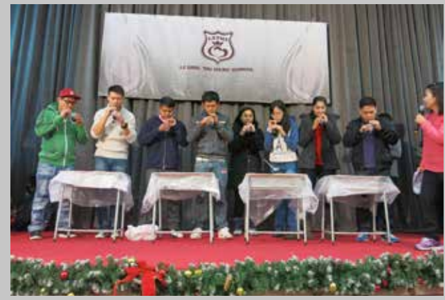
Parents and teachers participated in the Drinking Coke Competition.