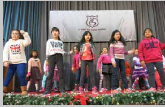
Jazz Dance performance at the Christmas Party.