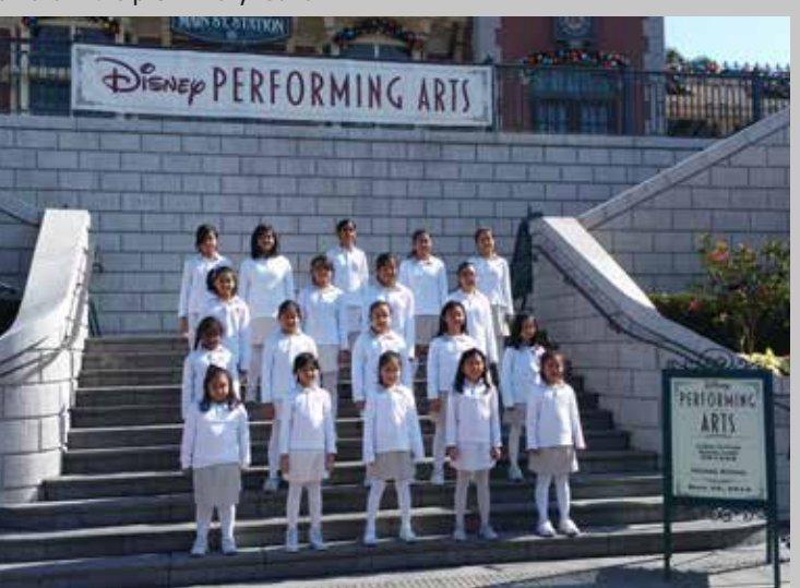
Our school choir members joined the Disney Performing Arts and performed in front of the Hong Kong Disneyland train station.