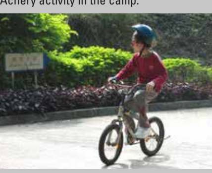
Students could ride their bikes along the cycling path.